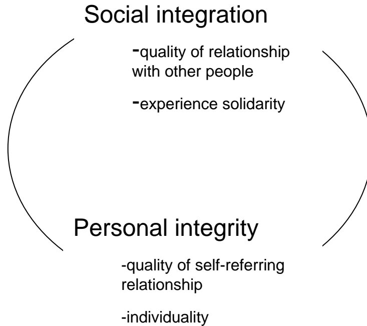
Figure 1: the circle between integrity and integration